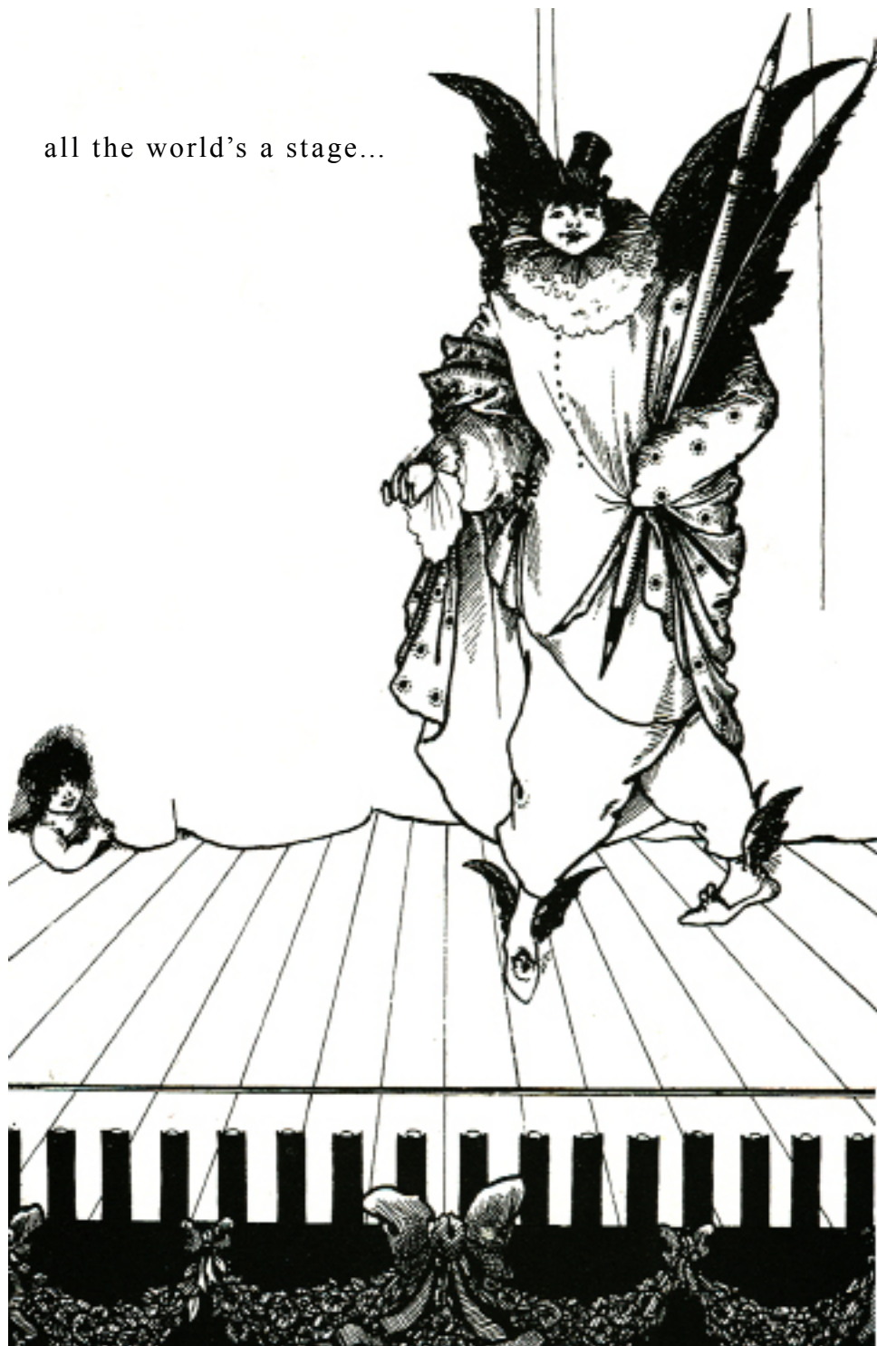
aubrey beardsley, ca. 1892