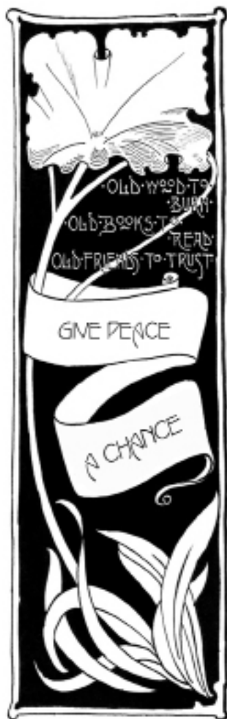
aubrey beardsley, ca. 1894